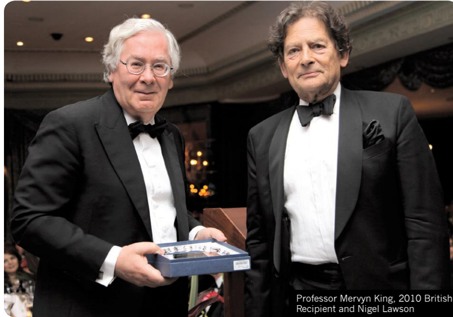
Professor Mervyn King, 2010 British Recipient and Nigel Lawson