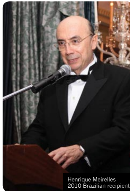
Henrique Meirelles - 2010 Brazilian recipient