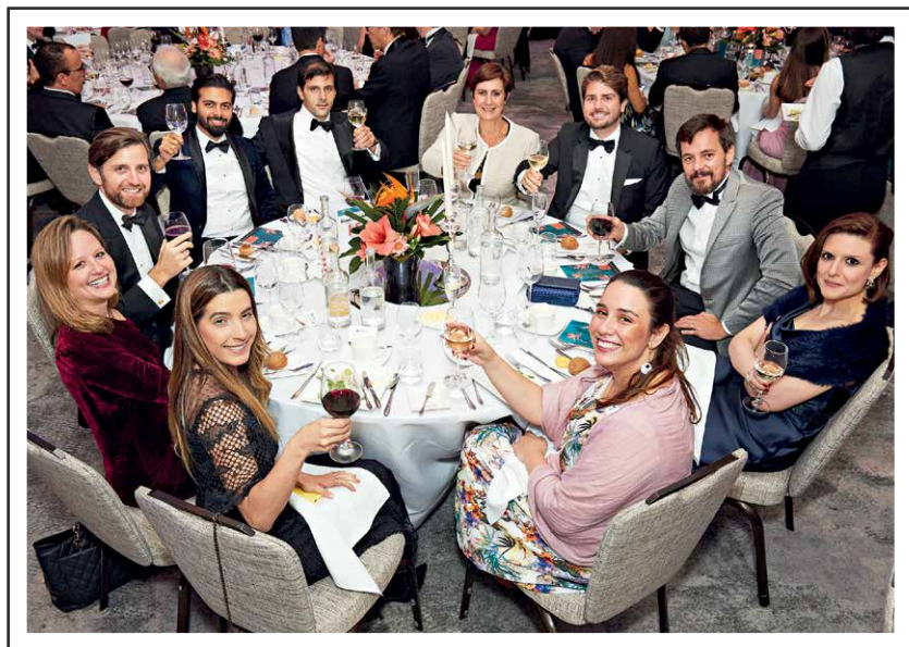
BANCO BRADESCO EUROPA S.A.