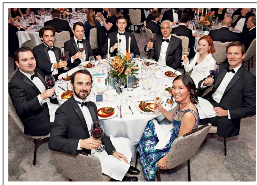
ITAU BBA INTERNATIONAL PLC