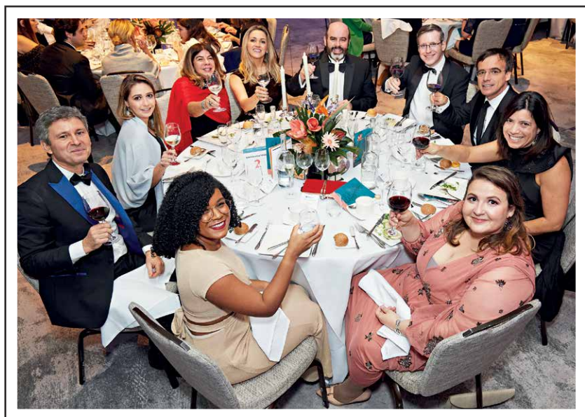
BRITISH AMERICAN TOBACCO