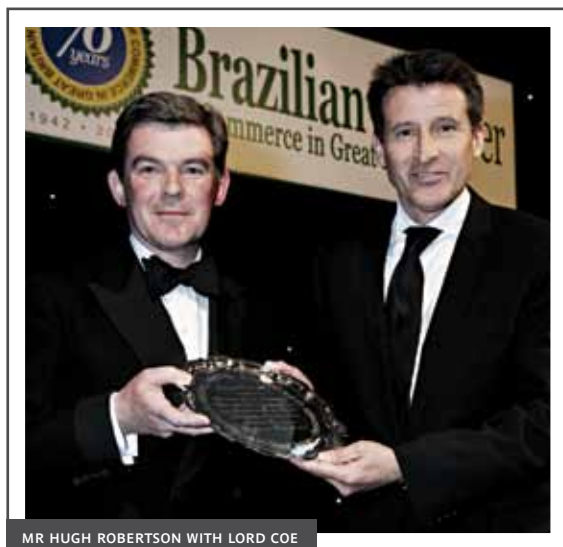
MR HUGH ROBERTSON WITH LORD COE