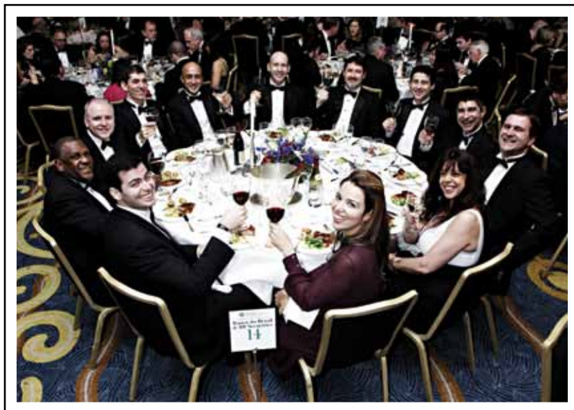
BANCO DO BRASIL & BB SECURITIES