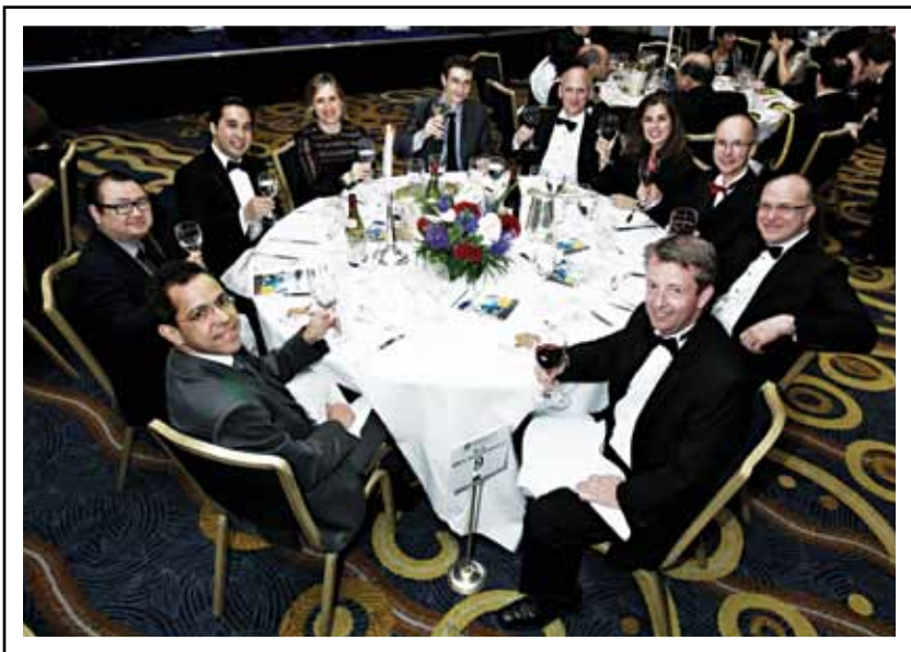
ITAÚ BBA INTERNATIONAL