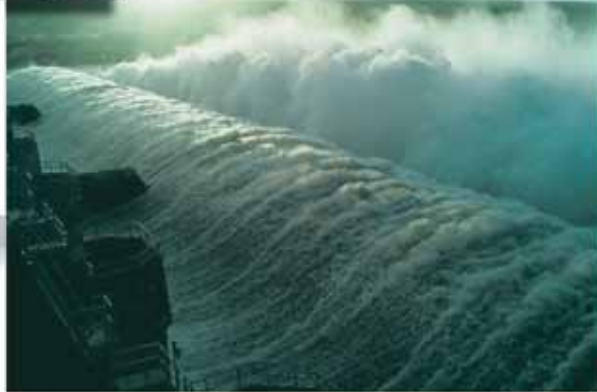
Tucuruí hydroelectric plant

Over the last 60 years, the Brazilian Development Bank (BNDES) has participated in all the main industrial and infrastructure projects in the country. Gradually, it has broadened its scope of operations and is currently present in all sectors of the Brazilian economy. Today, the BNDES finances undertakings of all sizes, in a wide array of sectors, such as industry, agribusiness, the environment, infrastructure, exports, innovation, trade, services and culture. The Bank also offers support for the internationalization of Brazilian companies and the strengthening of trade partnerships between Brazil and several other countries. Over the last year, some 896,000 operations were carried out, with disbursements reaching over US$ 76 billion. Visit www.bndes.gov.br/english to find out more.