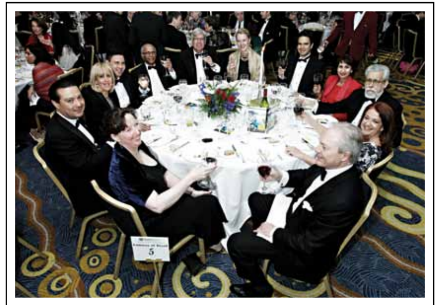
EMBASSY OF BRAZIL