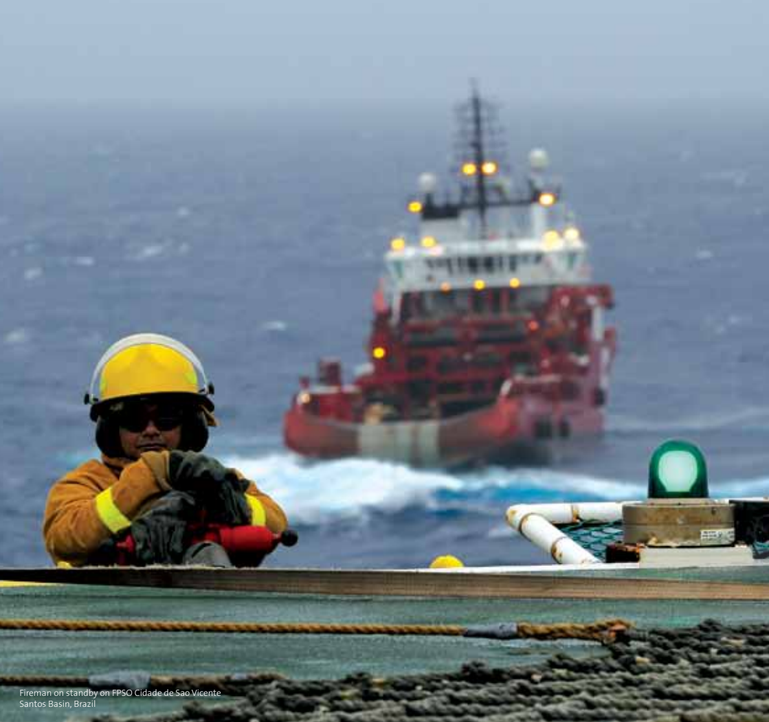
Fireman on standby on FPSO Cidade de Sao Vicente Santos Basin, Brazil