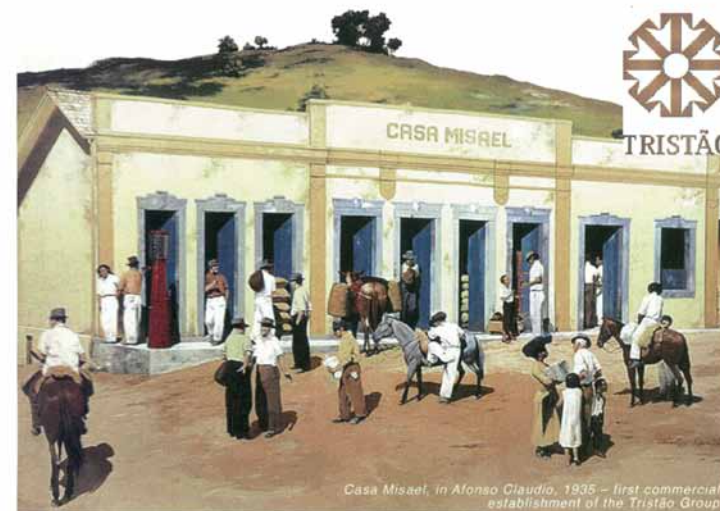
Casa Misael, in Afonso Claudio, 1935 – first commercial establishment of the Tristão Group