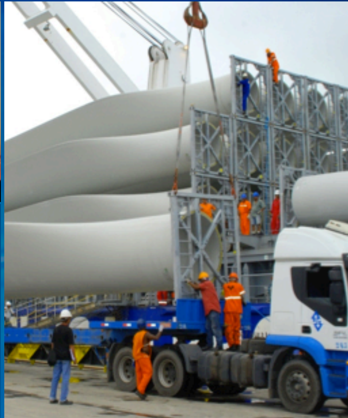
Blades for wind generators