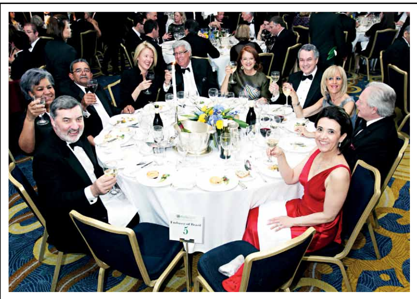
EMBASSY OF BRAZIL