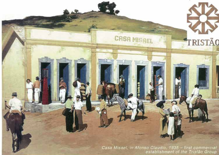
Casa Misrael, in Afonso Claudio, 1935 – first commercial establishment of the Tristão Group

Tristão Services Ground Floor, St. Mary's Court, 20 Hill Street, Douglas - IM1 1EU - Isle of Man. Tel: +44 (1624) 699860 admin@tristaioim.co.uk