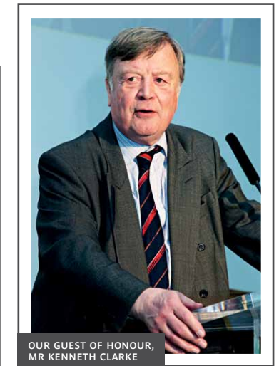
OUR GUEST OF HONOUR, MR KENNETH CLARKE