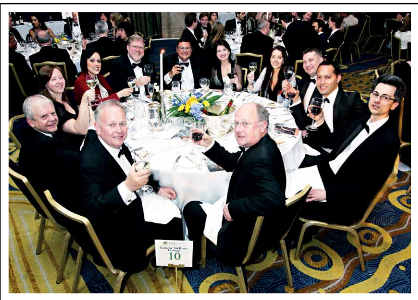
LATAM AIRLINES GROUP